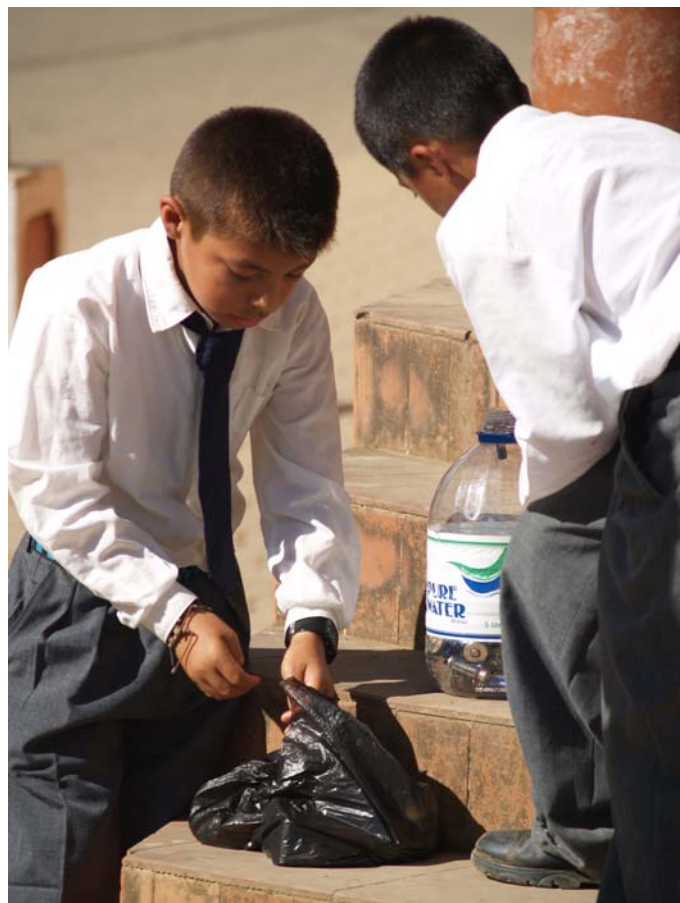
Figure 2. Children participate in the battery collection campaign.

My Community generated a lot of support from opinion leaders in the province, as this quote suggests: 'As a school authority, it is our mission to make spaces such as in the radio station available to students where they can interact with other students to talk about issues such as ecology or sexual health.