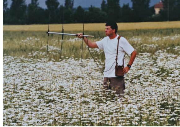
Figure 3. Radio-tracking wild pheasants in brood-rearing cover planted on rotational set-aside land, Seefeld Estate.

Monitoring: Pheasant hens were captured from 1 March - 10 April during 2001 - 2003 using maize-baited walk-in funnel traps. Hens were fitted with necklace radio collars (Holohil® model RI-2B) and located 2-3 times a week (Fig. 3). Nests, when located, were monitored three times a week. Once nests of tagged hens hatched, broods were located twice daily from a distance of around 15-30 m for the first 21 days to determine exact habitat use and home range size. A brood was considered lost during the rearing period if a brood 'caution' or 'gathering' call were not heard during consecutive observations, or if the hen died.