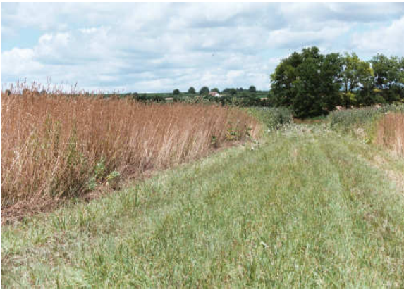
Figure 2. Strip cut through rotational set-aside planted with brood rearing cover to provide drying out areas for broods, Seefeld Estate.

Narrow strips were cut through the cover every 20 m or so to provide open 'drying out' areas for broods and to provide diversity in the sward structure (Fig. 2). These strips were cut early in the growing season (April) and maintained at a short height through the breeding season. They were cut in curved rather than straight lines to help reduce the risk of raptor strikes. The remaining cover was not cut until after the breeding season to prevent broods being destroyed by machinery. No herbicides or insecticides were used on these brood rearing areas.