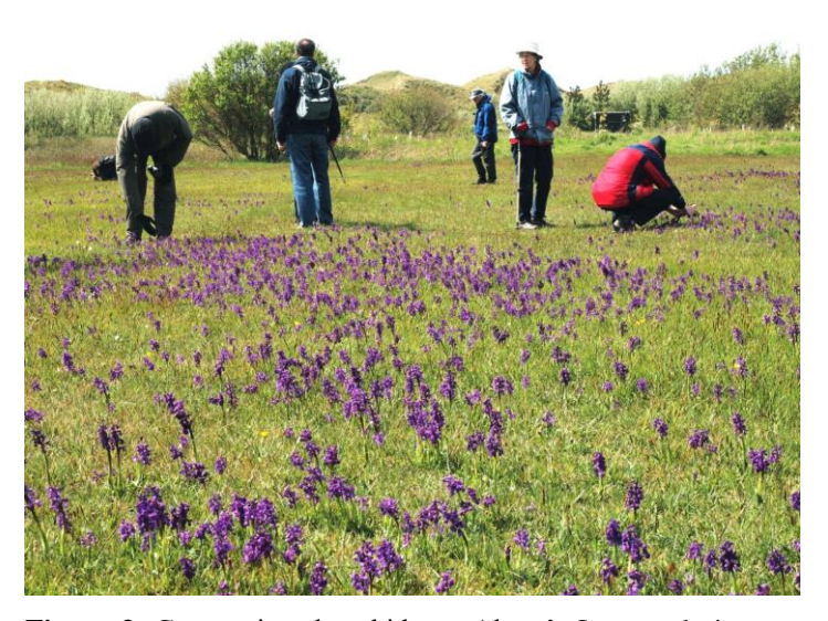
Figure 3. Green-winged orchids on Altcar's I-range during a public guided walk, May 2012

traditionally managed, grazed hay-meadows on circumneutral brown soils in the lowlands but is increasingly rare due to agricultural improvement. The Lathyrus sub-community is generally associated with fairly heavy brown-earths or superficial deposits with a low calcium content (Rodwell 1992).