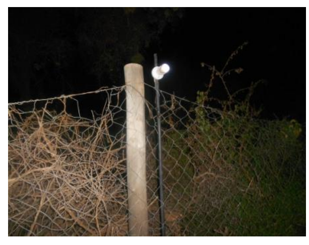
Figure 2. Flickering LED lighting system on a boma at night.

We started by testing the significance of the interaction between treatment and site, in order to quantify whether the effect of LED lights on predation (in terms of number of attacks and number of lost livestock) varied between the two sites. If this interaction was not significant, it was dropped from the model, which then included only two main effects predictors, namely site and treatment (in addition to the random term). We quantified the statistical difference between each pair combination of the three classes of the treatment variable (namely LED before, LED after, control) by running post-hoc tests with Tukey adjustment for multiple comparisons (package multicomp in R). Next, we derived the least square mean of the response variable (i.e. the predicted mean and standard error of number of attacks or livestock lost) for each of the three classes of the treatment variable (package lsmeans in R).