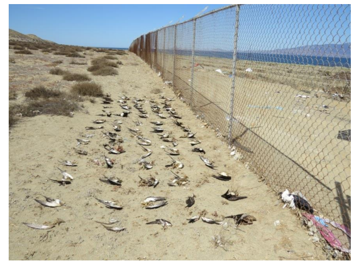
Figure 2. Carcasses collected during our first survey at the landfill on 11 February 2016.